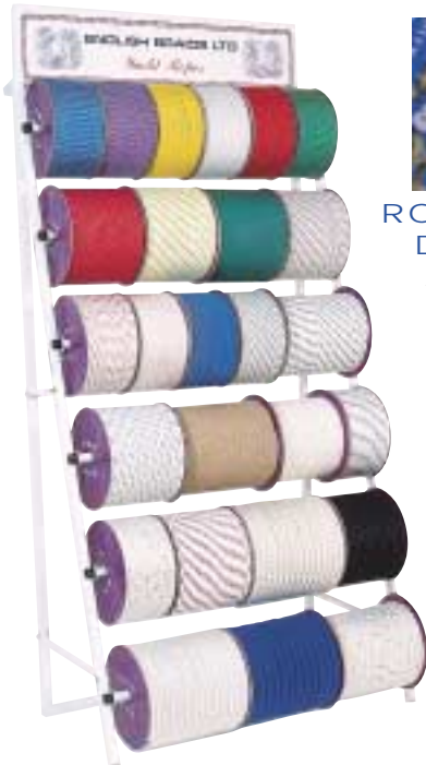
6 BAR RACK