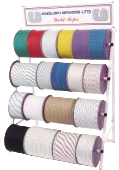
4 BAR RACK