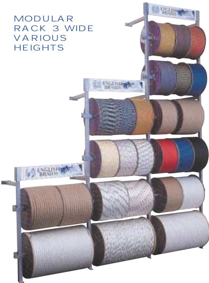
MODULAR RACK 3 WIDE VARIOUS HEIGHTS