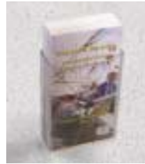
PRODUCT INFORMATION GUIDES WITH DISPENSER