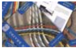
ROPE TECHNICAL DATA SHEETS Available on request, printed or PDF file